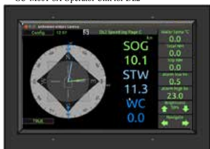
CU-M001-SA Operator Unit for DL2

Navigation Dual axis Doppler speedlog STW + SOG