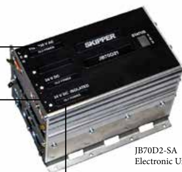
JB70D2-SA Electronic Unit