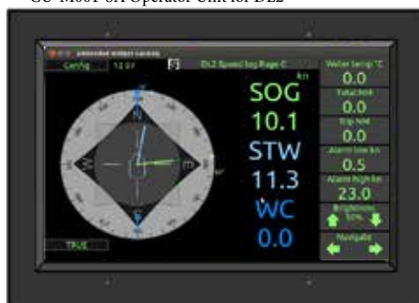
CU-M001-SA Operator Unit for DL2