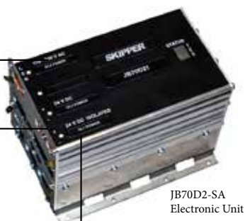
JB70D2-SA Electronic Unit